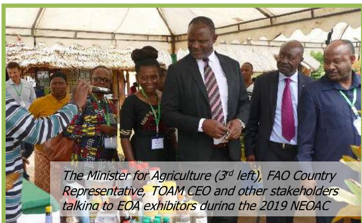
The Minister for Agriculture (3 rd left), FAO Country Representative, TOAM CEO and other stakeholders talking to EOA exhibitors during the 2019 NEOAC

Tanzania Organic Agriculture Movement together with the Ministry of Agriculture and Cooperatives in collaboration with agriculture stakeholders and development partners including UN-FAO, SWISSAID Tanzania, Sokoine University, Sustainable Agriculture Tanzania (SAT), TABIO, PELUM, The French Embassy, Iles de Paix (IDP) and St. Joseph Sustainable Organic Farm organized the 2nd National Ecological Organic Agriculture Conference which took place at St. Gasper Conference Hotel in Dodoma from the 19th and 20th October, 2021.